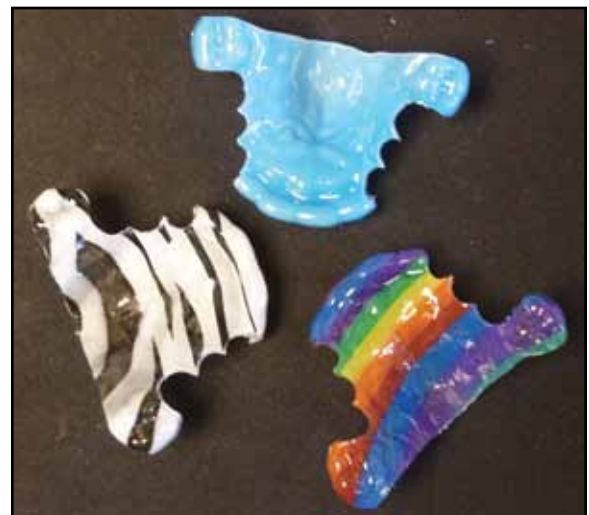
Fig. 2 Updated Theroux Phase I Retainers made from Patterned Biocryl.**