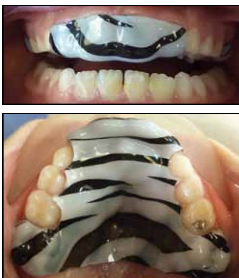
Fig. 5 Final appliance made from Patterned Biocryl.