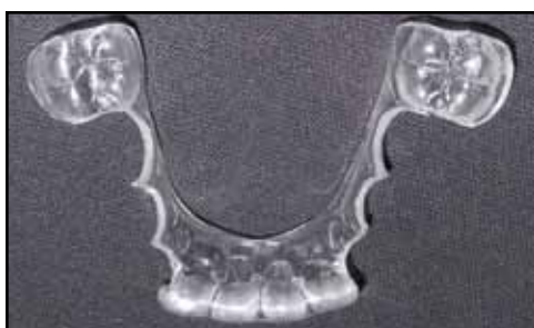
Fig. 6 Mandibular version of updated Theroux Phase I Retainer.

(Fig. 5) are slightly more durable and may therefore be preferred once the technician is familiar with the procedure and no longer needs the reference lines. Patients also seem to like the Patterned Biocryl retainers.