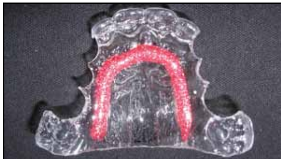
Fig. 1 Original Theroux Phase I Retainer, made from Essix type ACE* material.