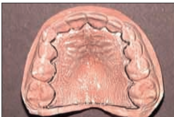
Fig. 4 Palatal layer of Essix material cut off and replaced on cast.

**Dentsply International, Inc., 570 W. College Ave., York, PA 17405.