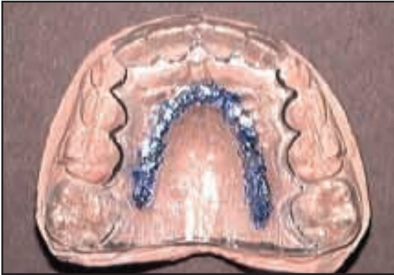
Fig. 7 Completed retainer.