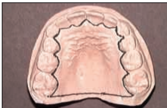
Fig. 2 Black line drawn on cast to mark first palatal layer of retainer.