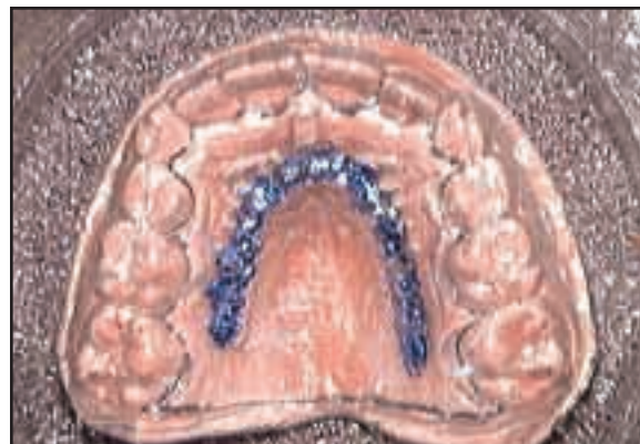
Fig. 6 Second layer of Essix material vacuum-formed over cast.

Seat the retainer in the mouth with finger pressure (Fig. 8). Show the patient how to remove it by pulling down on the incisal material.