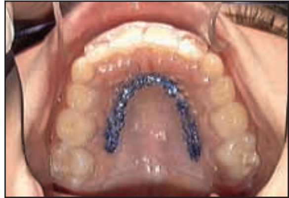
Fig. 8 Retainer seated in mouth with finger pressure.

The retainer should be worn only while sleeping, stored in a retainer case when not in the mouth, and brushed daily with toothpaste. Patients are seen at four-to-six-month intervals, and the palatal material is trimmed as necessary with an acrylic bur in a slow-speed handpiece to allow for bicuspid eruption.