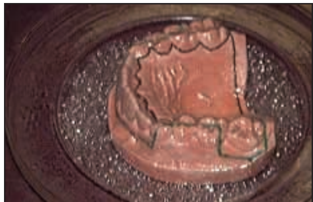
Fig. 3 Green line drawn over Essix material to mark where acrylic is cut from cast.