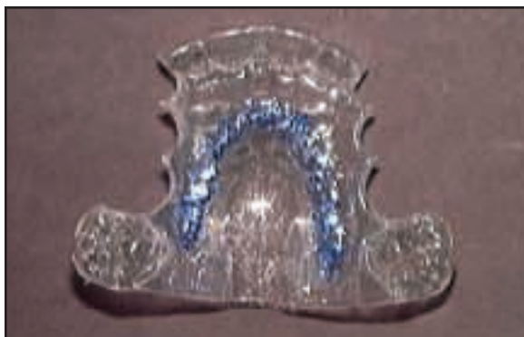
Fig. 1 Theroux Phase One Essix retainer.